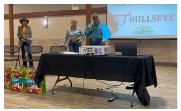
Producer Panel underway

Despite Harvest being in full-swing for most producers, we saw 50 attendees come out to enjoy an evening of networking and education on marketing cattle.